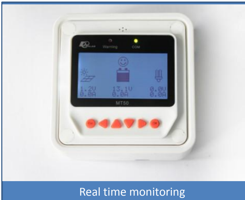
Real time monitoring