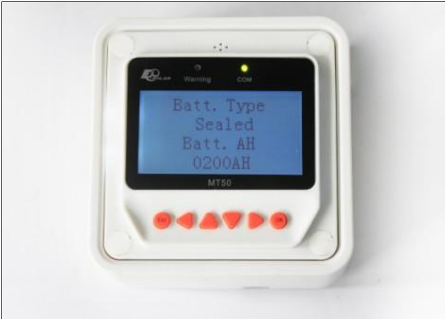
Battery type setting