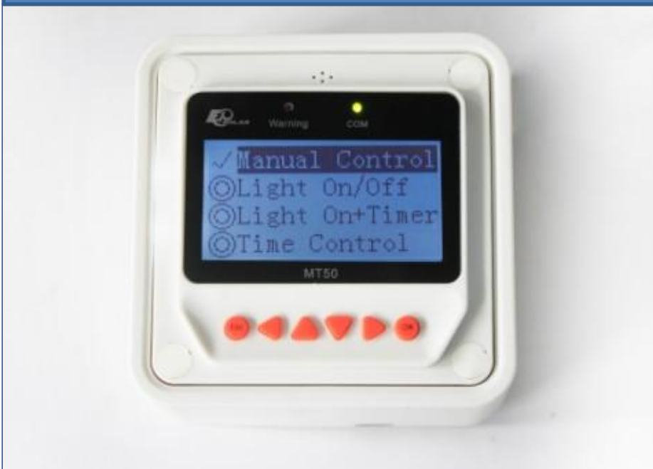
Load mode setting