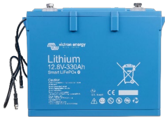
12,8V 330 Ah LiFePO4 Battery